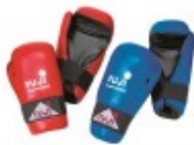
Open Gloves (Leather)