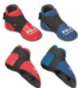
Foot Protector (Leather)