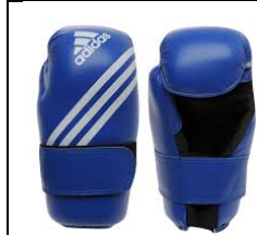
Semi Contact Glove