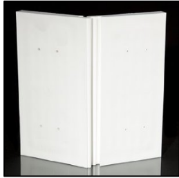
Re-Breakable Board White (Soft Difficulty)