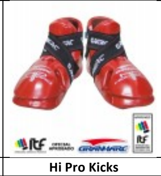
Hi Pro Kicks