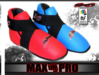
ITF Approved Kicks (Artificial)