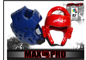
ITF Approved Fighter Helmet