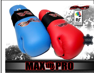
ITF Approved Gloves (Leather)