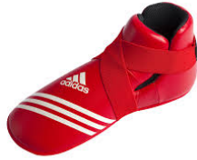
Super Safety Kick