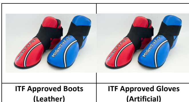
ITF Approved Boots (Leather)