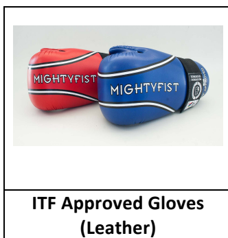
ITF Approved Gloves (Leather)