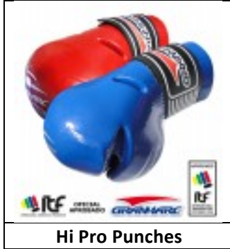
Hi Pro Punches