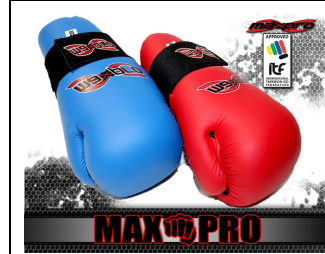
ITF Approved Gloves (Artificial)