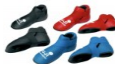
Foot Protector (Artificial)