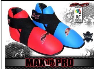
ITF Approved Kicks (Leather)